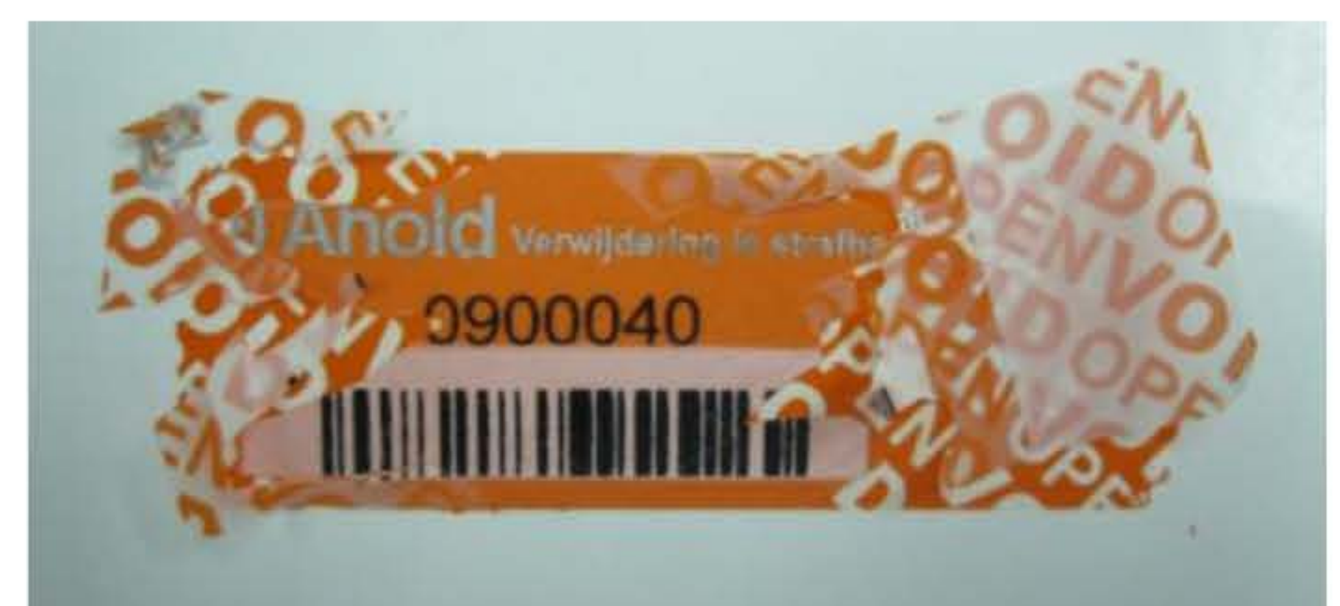
Label with optional security cuts