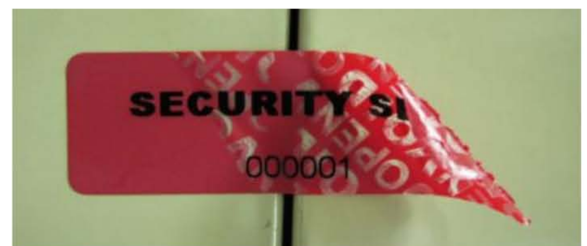
Non Transfer Label when opened