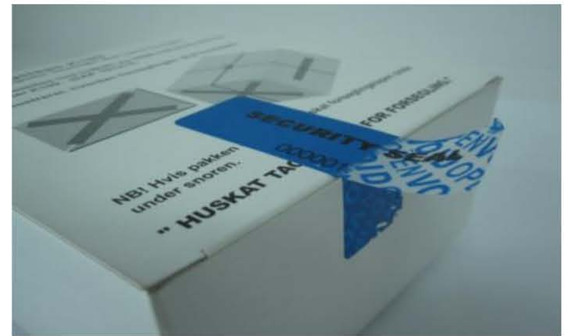
Partial Transfer Label when opened