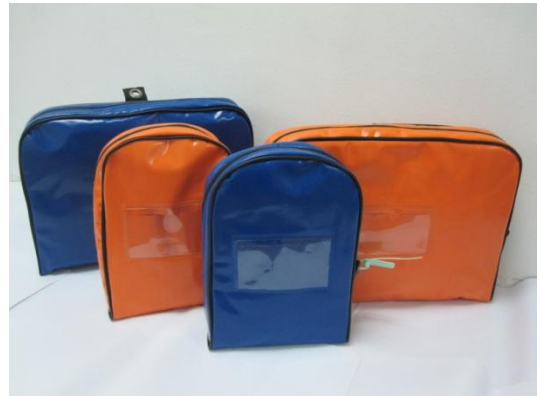
Nylon Tote Bags

CIT tote security bags can be purchased in your choice of locking options, fabrics, and sizes. Bags can be customized with your company name, Logo and serial numbered for added security.